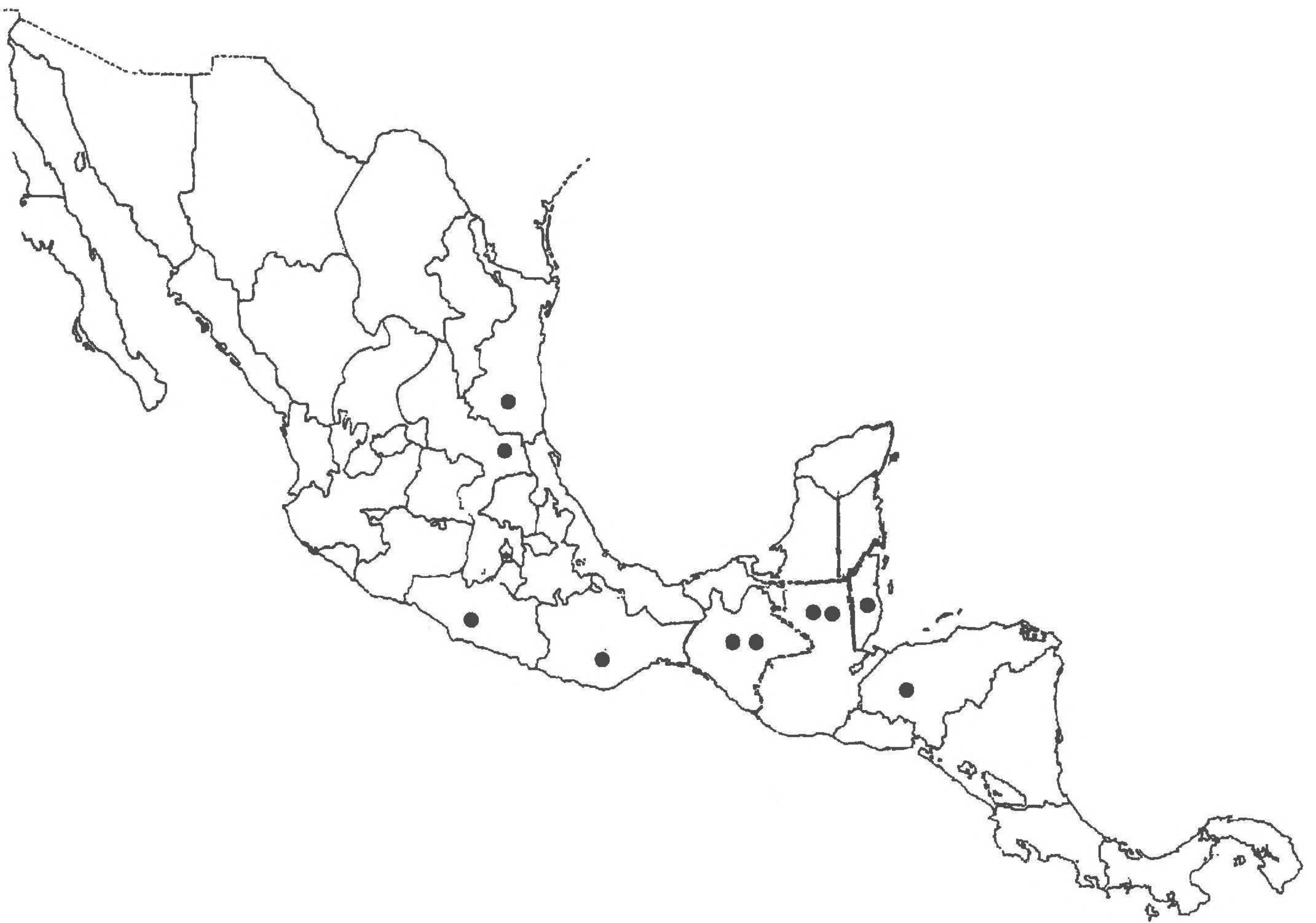
FIG. 2. Distribution of Capsicophysalis potosina .